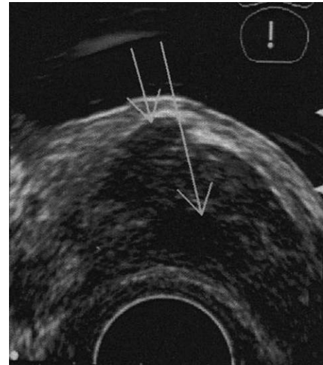
Fig. 2. TRUS (arrow : abscess cavity)

CT showed prostate abscess with septum. The length of the major axis of the abscess cavity was about 6 cm.