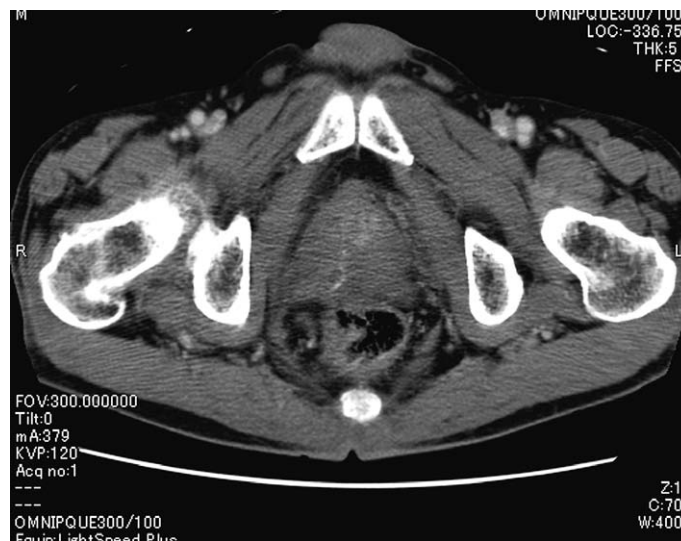
Fig. 5. At two months after transurethral drainage CT showed no recurrence of abscess in the prostate.