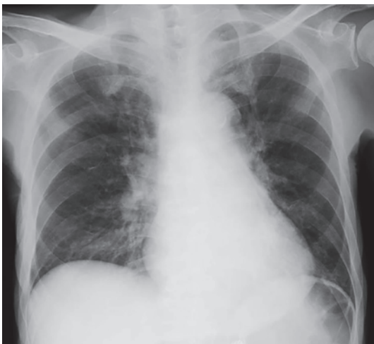
Fig. 2. Chest X ray during respiratory syncytial virus diagnosis (Case 3) Ground glass shadow in the right lower field.

All cases were treated with supportive therapy, including antimicrobial agents: cefepime for two patients, PZFX for one patient, and meropenem for one patient (Table 1). Additionally, two patients were treated with steroids. Prior to discharge, two of the cases of RSV infection resolved. In Case 2, the patient died secondary to his hematological disorder on hospital day 49. Case 3 died on hospital day 33 due to pneumonia and complications associated with his primary hematological disorder (Table 1). Chest computed tomography (CT) on the seventh day following RSV infection in Case 3 revealed bilateral ground glass infiltrates and infiltration shadows (Figure 3). In response to this outbreak, members of the medical staff were directed to pay careful attention to hand hygiene and to wear surgical masks while on duty. No staff members developed RSV infection.