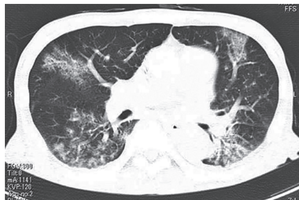
Fig. 3. Chest CT 7 days after respiratory syncytial virus diagnosis (Case 3) Infiltration and ground glass shadows in bilateral lung fields.